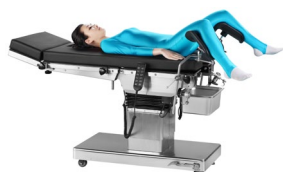
(Optional) Waste Basin For Gynecology