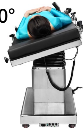
Lateral Tilt Left 0°-20°