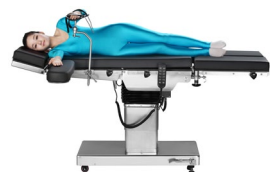
(Optional) Lateral Arm Support