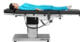
Longitudinal Adjustment 0-300mm