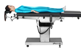
(Optional) Head Rest