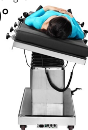
Lateral Tilt Right 0°-20°