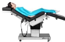
E.N.T Operation Position