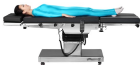
Lowest Position of Table Top 800mm