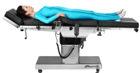
Kidney Bridge Elevation 110mm