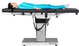
Highest Position of Table Top 1000mm