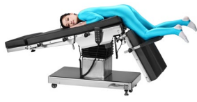
Anorectum Operation Position